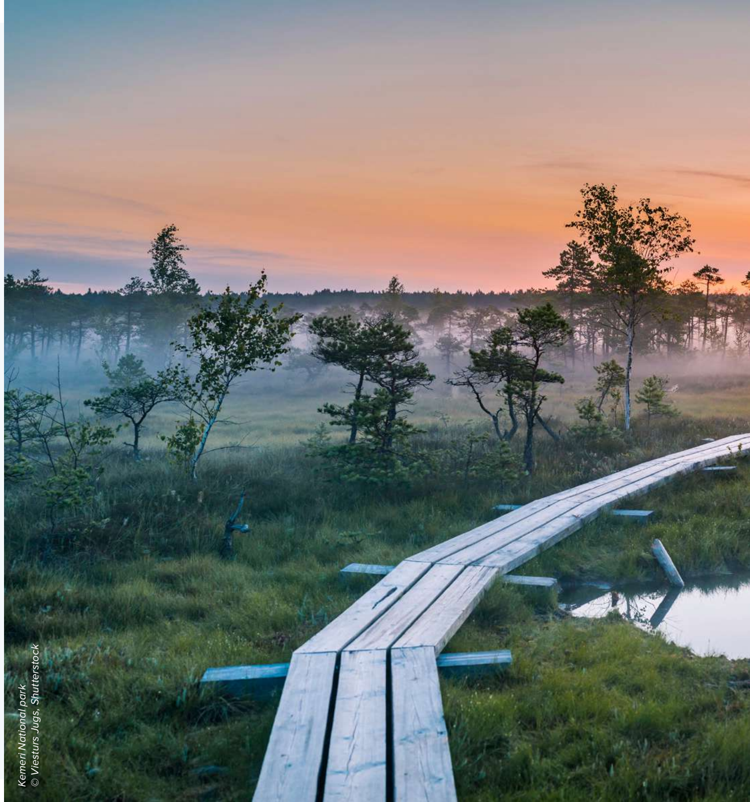
Kemerli National park

In this section, you can find the practical info and resources needed for setting up your longer stay.