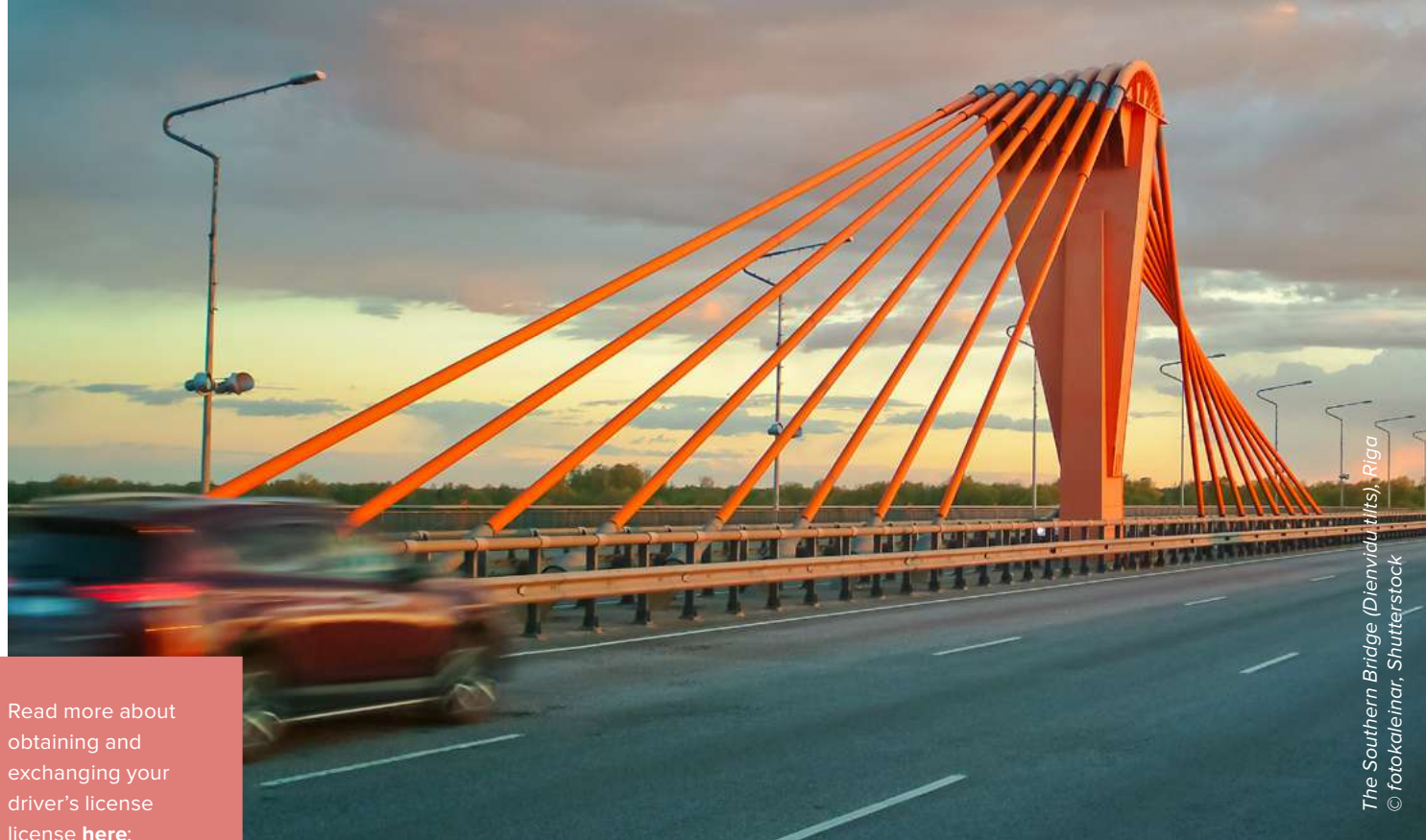
The Southern Bridge (Dienvidu tilts), Riga

NB! UK citizens can exchange their driving license without taking additional exams.