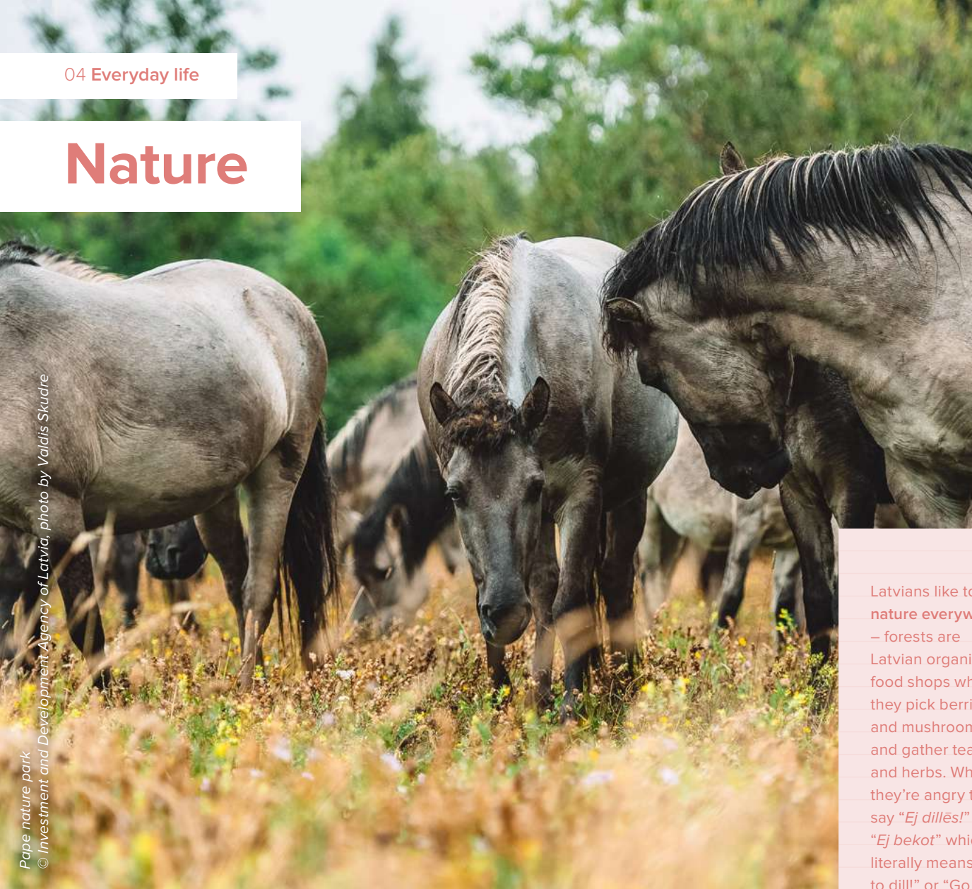
Pape nature park

Latvians like to put nature everywhere – forests are Latvian organic food shops where they pick berries and mushrooms and gather teas and herbs. When they're angry they say "Ej dillēs!" or "Ej bekot" which literally means "Go to dill!" or "Go pick mushrooms!".