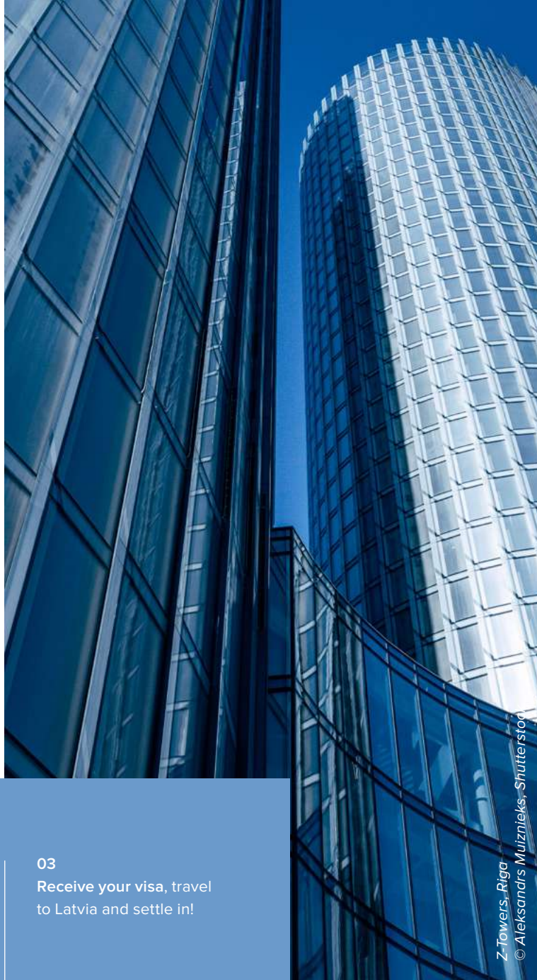
Z-Towers, Riga

Receive your visa, travel to Latvia and settle in!