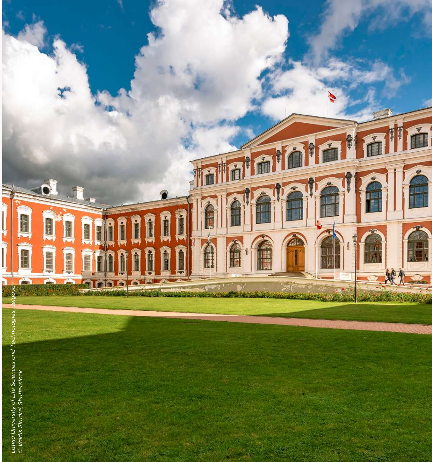
Latvia University of Life Sciences and Technologies, Jelgava