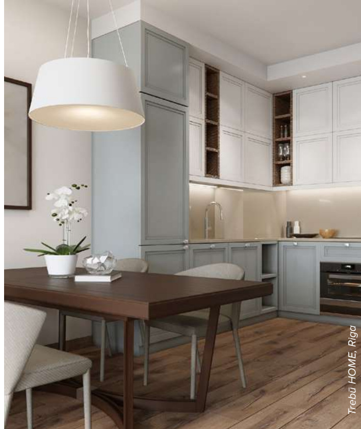
Trebu HOME, Riga

The process is simple – you see a listing you like, then get in touch with the listed contact person. You can request to arrange a viewing. If you like what you see, you can let them know you'll take it. Keep in mind – this usually happens on a "first come, first served" basis, so timing is important.