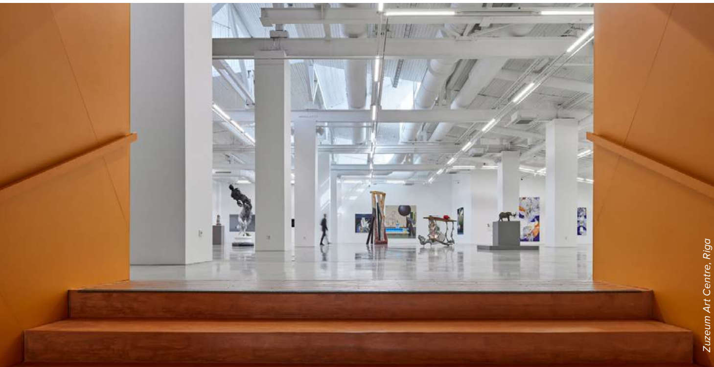
Zuzeum Art Centre, Riga