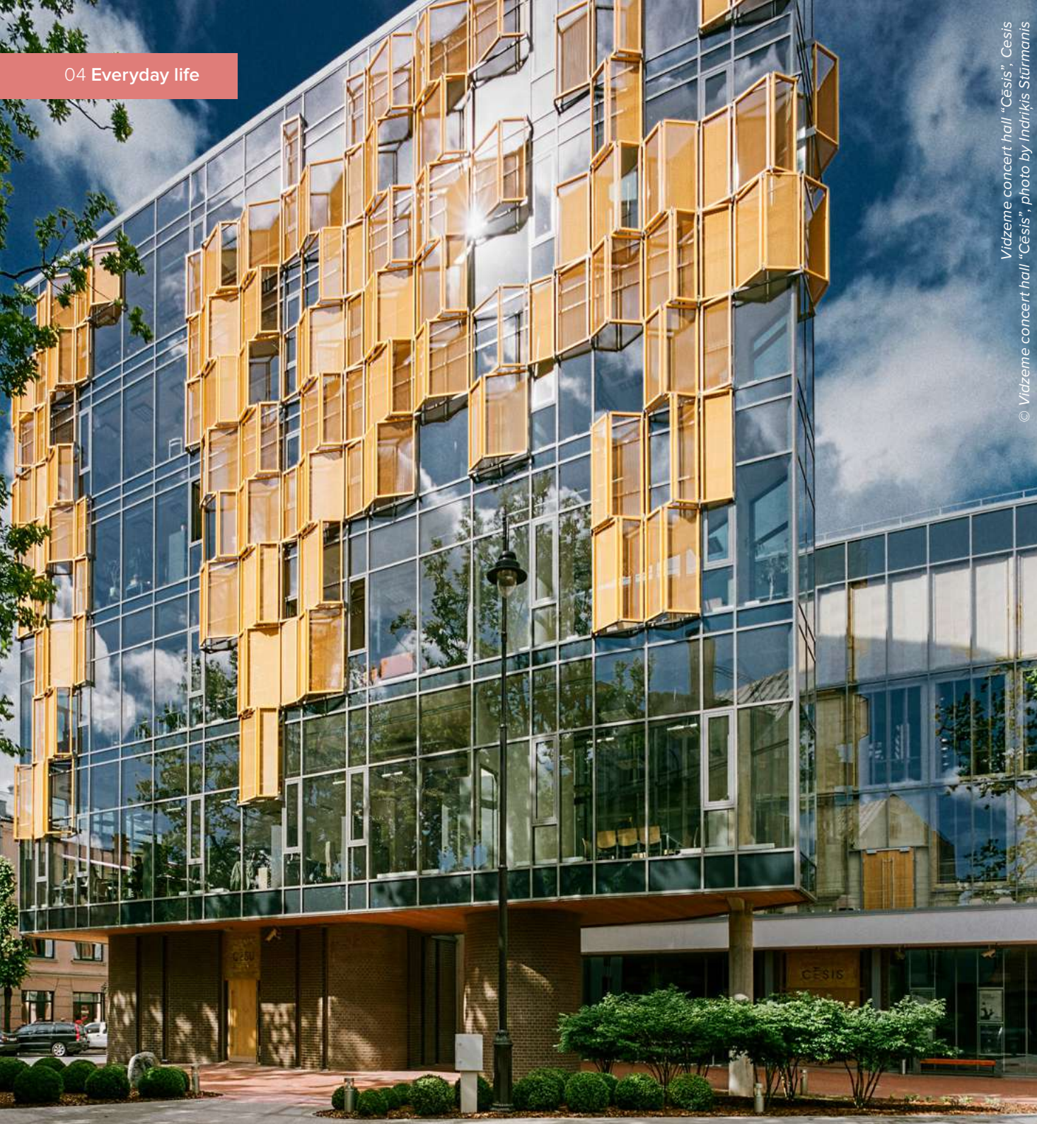
Vidzeme concert hall "Cēsis", Cēsis