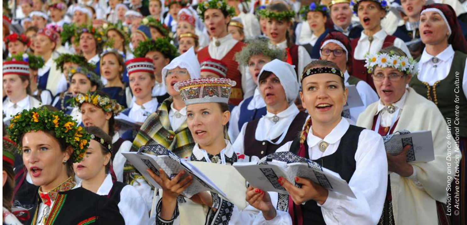
Latvian Song and Dance festival

Latvia is home to world-class musicians such as opera singers Elina Garanča, Inese Galante, Kristīne Opolais, conductor Andris Nelsons, violinist Gidon Kremer, and so many more.