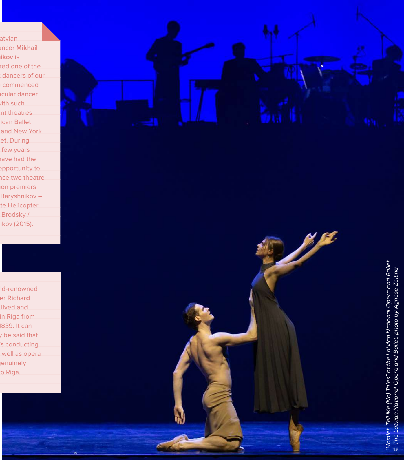
"Hamlet. Tell Me (No) Tales" at the Latvian National Opera and Ballet

The world-renowned composer Richard Wagner lived and worked in Riga from 1837 to 1839. It can rightfully be said that Wagner's conducting style, as well as opera Rienzi , genuinely belong to Riga.