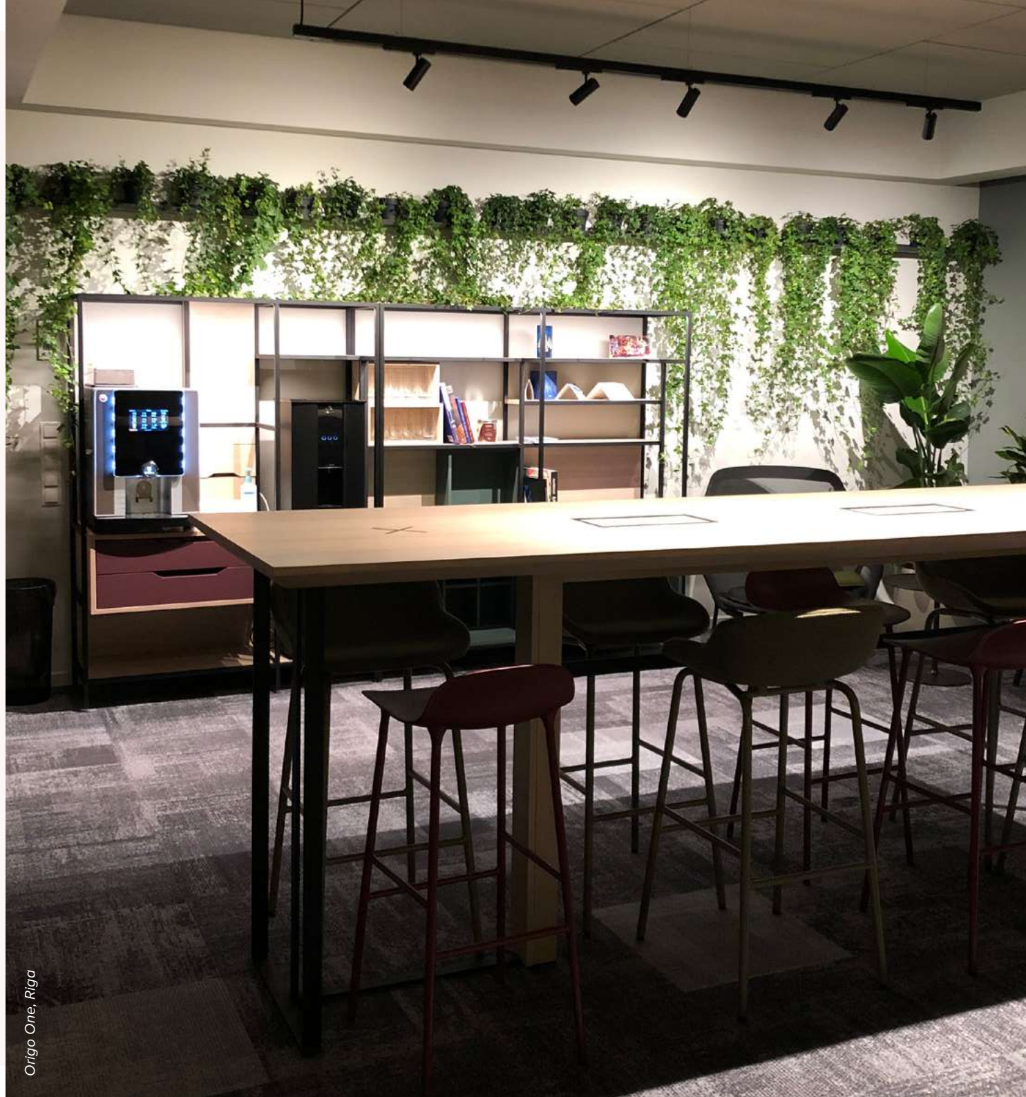
Origo One, Riga

Let's go over the basics of finding employment, starting a business, and any programs that might help you in that process.