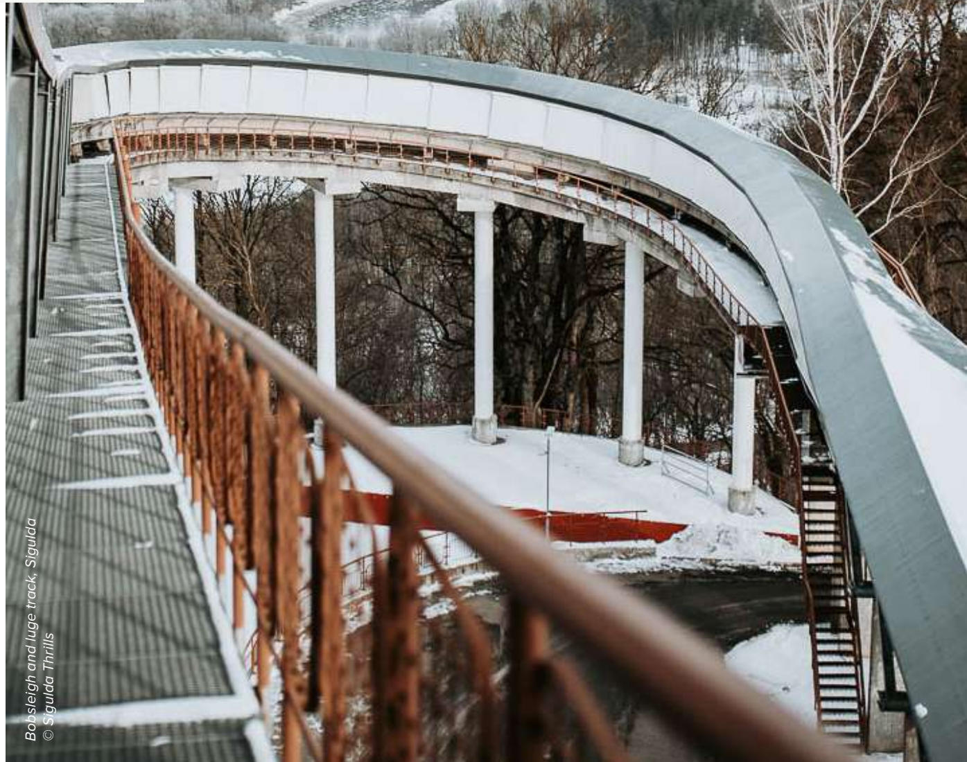
Bobsleigh and luge track, Sigulda

Of the last 3 Olympic events, 10 Olympic Winter Games medal winners come from Sigulda, making it the #1 municipality in the world in terms of medals per capita.